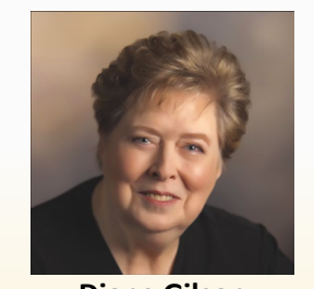
President & Founder Info Plus Accounting, Inc. & BuildYourNumbers.com